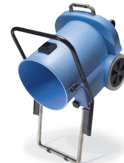
Unique 900 Tip-Empty System

The mid range EcoWet 570 and 900 designs are classics in every respect both in design and manufacture and have now been raised to our full EcoWet 38mm (1 1/2") standard, providing performance enhancements allowing single motor models to perform to that of earlier twin motored units. Yes EcoWet means up to 50% energy saving, changing 2 motor models to simplex one motored operation.