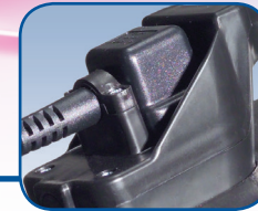
NuCable Plug System