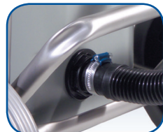
WVD2000DH Dump Hose