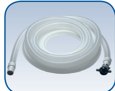
10m Discharge Hose For AP