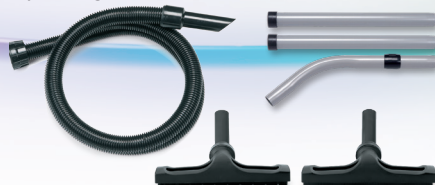
ProFlo Wet Pick-up Nozzle