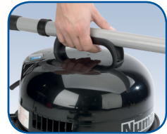
Easy Carry Handle

With the full range, however, design and attention to detail are based on continuously improved products that have stood the test of time in professional use and they all reflect 15, or more, years of user experience, coupled with our high quality standards which are second to none in products of this type, ensuring long service life and total reliability.