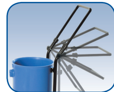
Fold Down Transit Handle WV470