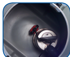
AP Submersible Pump System