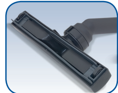
300mm Pick-Up Nozzle