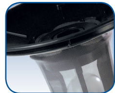
Safety Net Filter