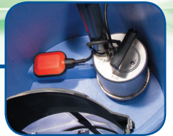
AP Submersible Pump Unit

Auto pump models provide for continuous operation as may be needed in the event of flood damage, pumping out literally as much water as you can take in.