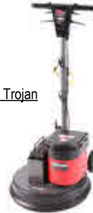
Heavy Duty Trojan