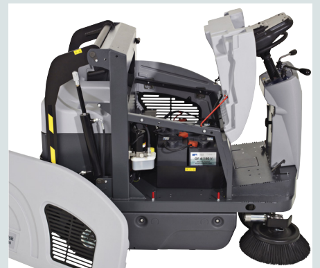
Maintenance is easy since no tools are needed for broom and filter removal and easy access to all components makes maintenance and service fast and easy