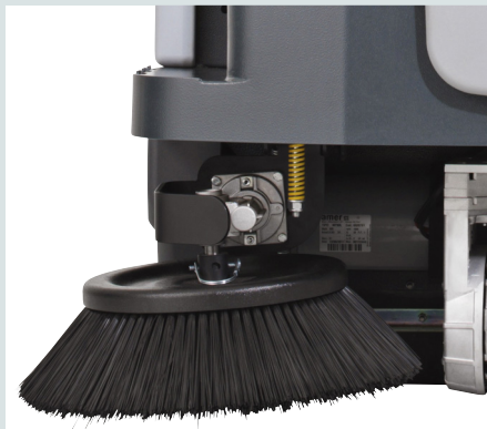
DustGuard™ misting system adds to the dust free sweeping improving the environment for operator as well as the surroundings (optional)