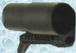
Short Nozzle CVA