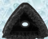
Triangular Brush MGD12