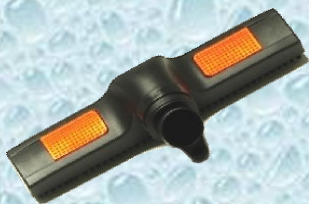
Floor tool CVH