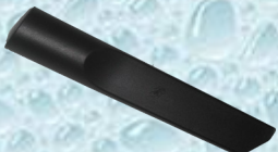
Crevice tool CVE