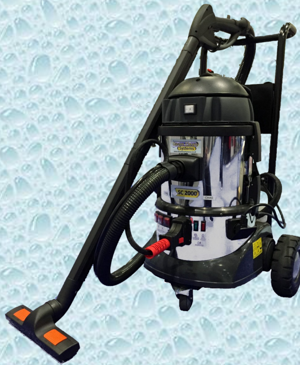
The SC2000 with Trolley

For extra Mobility the SC2000 is available with a handy trolley as an optional extra.