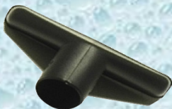
Vacuum gulper CVC