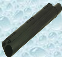
Extension tube x 2 CVO