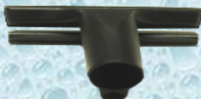
Steam and suction tool CVG1