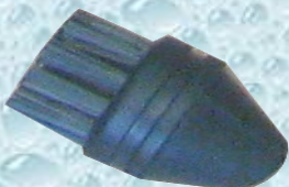
Detail Brush CVB