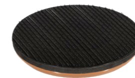
Pad holder Item no. 202.010

Extremely quiet and easy to operate, suitable even for unexperienced users.