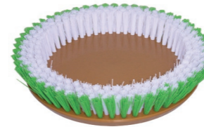
Brush medium Item no. 202.011