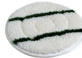
Queen Bonnet-Pad - Item no. 202.034

The Queen Bonnet pad for the best cleaning results on carpets and carpeted floors.