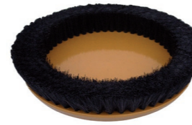
Brush soft Item no. 202.012