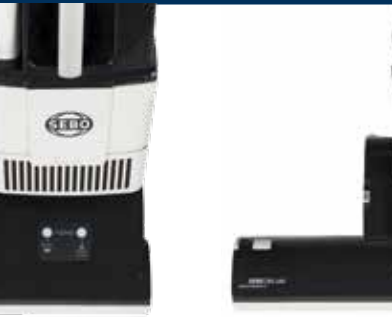
HIGH FILTRATION A built in HEPA filter gives 'A' rated filtration.

The trap door, easy to remove hose and ability to separate the top and bottom of the machine make clearing blockages easy.